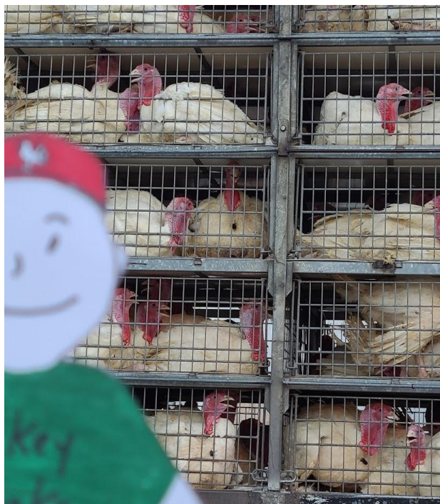
To learn more visit Iowa Turkey Federation.

The processing plant makes the turkeys into meat. Some of Flat Aggie's favorite turkey meats include turkey breast and turkey lunch meat!